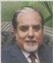
>> Subhash Chandra, Chairman, Essel & ZEE Group

The spirit of entrepreneurship needs to be enhanced and nurtured, since it creates employment opportunities, giving a boost to the overall economy.